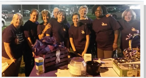
Left to Right/Top to Bottom: Arcadia High School cheerleaders wear purple ribbons; Broadwater Academy football team members wear purple socks at Homecoming; Nandua High School players wear purple socks; Arcadia High School players show their purple socks support; ESCADV staff and volunteers at an information table during a football game.